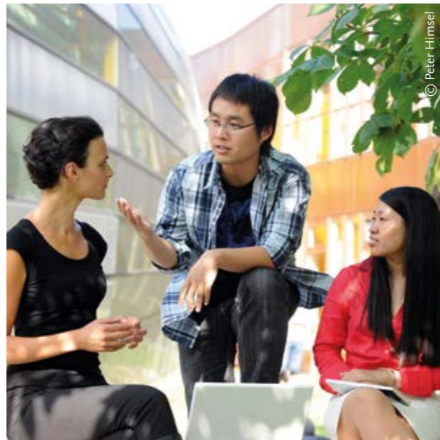
The School of Veterinary Medicine at Freie Universität Berlin

The system accreditation is implemented at Freie Universität Berlin to assure quality in the various study programmes.